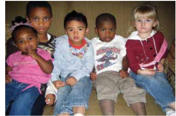
Above: Several homeless children a few days before Christmas