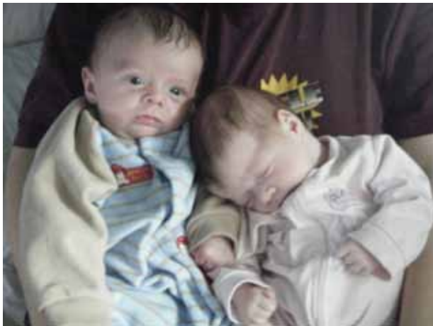
Above: Premie twin brother and sister in our women's & children's shelter

The Siena/Francis House has an “open door” policy, in that we try to never turn away any family or individual who comes to us in need. All of our services are provided at no cost to our guests.