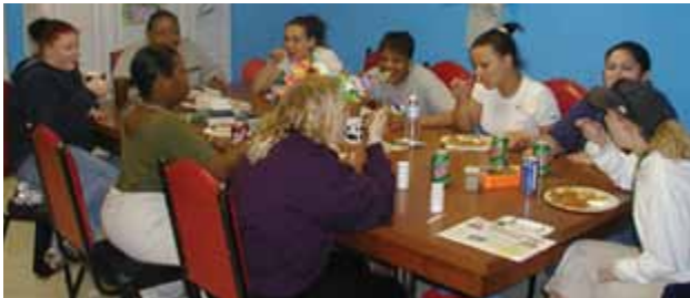
Above: Homeless women sharing a meal

Sort and repackage donations which are often delivered to us in large quantities.