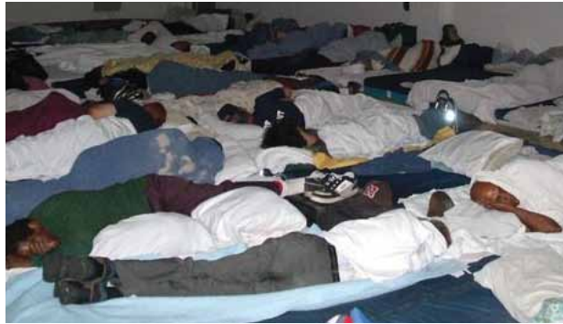
Above: Men's overflow shelter

Founded in 1975, the Siena/Francis House operates an overnight shelter, serves daily meals, and provides clothing and outreach services for homeless men, women and children. The Siena/Francis House is an independent, non-denominational, 501(c)(3), tax exempt charitable organization, and our federal tax identification number is 47-0601005. Siena/Francis House is not a United Way member agency and does not receive United Way allocations or grants.